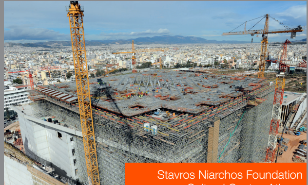
Stavros Niarchos Foundation Cultural Center, Athens