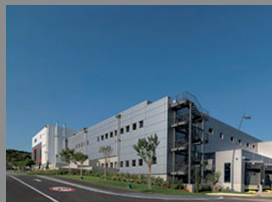
Media Strom S.A.- Media Strom Factory Construction of the new factory of Media Strom company (17.000 m 2 , total area of 43.000 m 2 ), Markopoulo, Attica