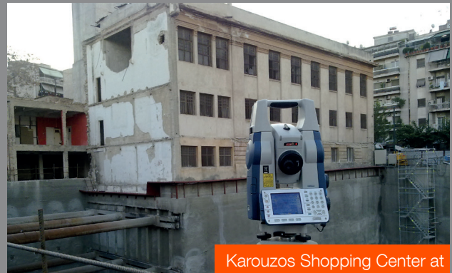
Karouzos Shopping Center at Larisis Train Station