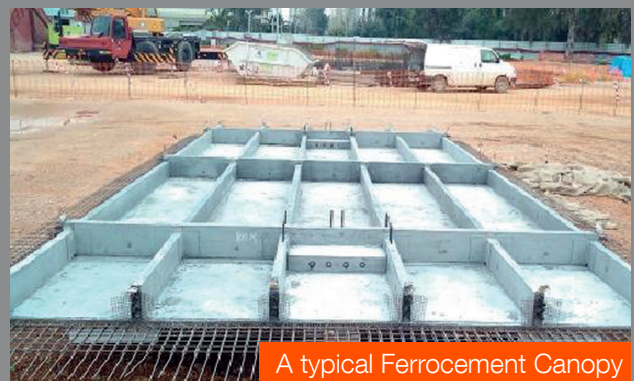
A typical Ferrocement Canopy Panel at SNFCC