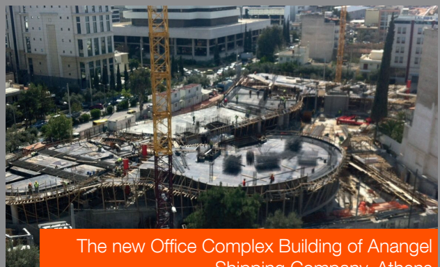
The new Office Complex Building of Anangel Shipping Company, Athens