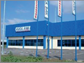
Arcon S.A. – Alex Pak Store Construction of Alex Pak Store, Pallini, Attica