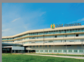
Intrakat S.A. – Iaso Thessalias Construction of Iaso Thessalias – Medical Center, Larisa, Thessalia