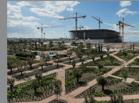
J/V Terna S.A., Salini Impregilo S.p.A. - SNFCC Construction of Stavros Niarchos Cultural Center, Faliro, Attica