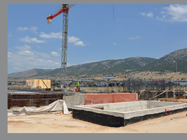
J/V Terna S.A., Aktor S.A. - Tredeable station at Thriassio Construction of 2nd operational phase of Thriassio Pedio Complex – Railway Station of Zefiri, Attica