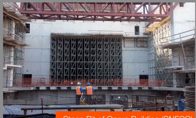
Stage Pit of Opera Building (SNFCC)