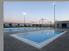
Arcon S.A - Sports & Leisure Park Construction of the Sports and Leisure Park of Municipality of Kallithea, Attica