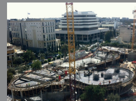
Intrakat S.A. - Office Complex Building of Anangel Construction of the new office complex building of Anangel shipping company, Kallithea, Attica