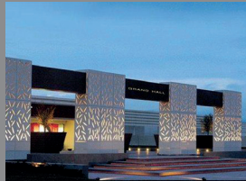
Terna S.A. – Grand Resort Lagonissi Construction of Grand Resort Lagonissi – Conference Center, Attica