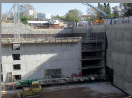
Iliochoira S.A. - Underground Parking Construction of 6 floor underground parking building, Kifisia, Attica