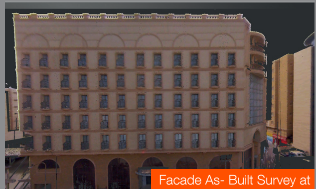
Facade As- Built Survey at C-Ring at Doha, Qatar