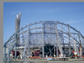
DS Steel S.A.- Steel Work Eastern Structural Steel Work for the Doha 2006 Asian Games Ceremonies, Doha, Qatar