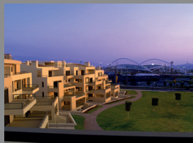
Intrakat S.A. - Ilida Building Complex Construction of Ilida Building Complex, Marousi, Attica