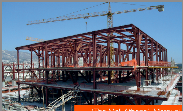
'The Mall Athens', Marousi