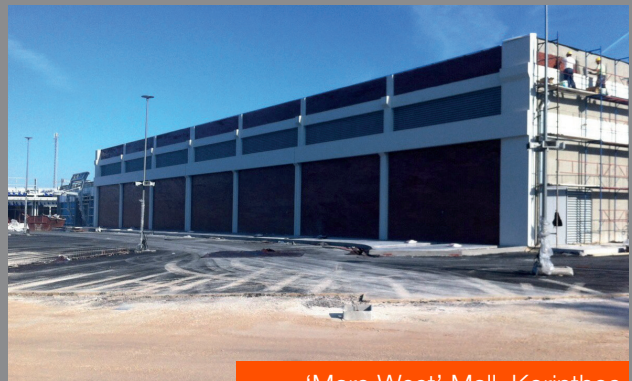
'Mare West' Mall, Korinthos