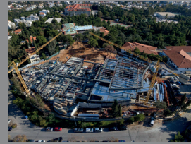
Intrakat S.A.- HAEF Erection of the Model Kindergarten “Ioannis M. Karras” of the HAEF at the Psychiko Campus, Attica